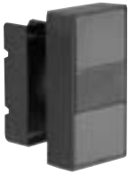
8 LP2T B7113