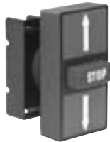
8 LP2T B7355