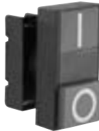
8 LP2T B7223