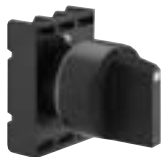
8 LP2T S1