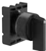
8 LP2T S2