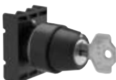
8 LP2T S3