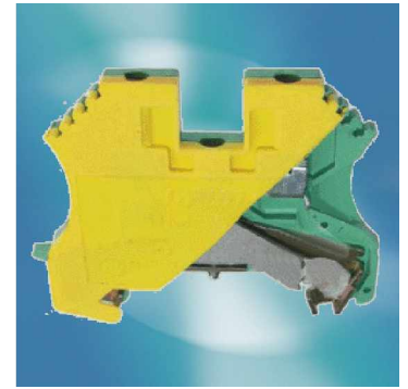
Terminal Width 5mm