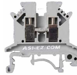
Terminal Width 6.2mm