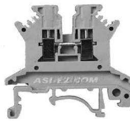
Terminal Width 4.2mm