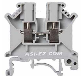
Terminal Width 5.2mm