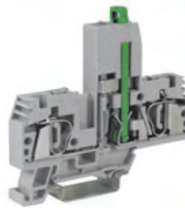
for Ø 5 x 20 mm fuse

Possibility of the insertion of a LSH type indicator (for 12, 24, 48, 115 or 230 V), supplied also separately, equipped with a red coloured LED. The blow-out of the fuse determines the ignition of the LED, with a current flow of approximately 2 mA in a.c. or 5 mA in d.c.