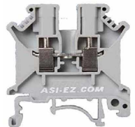
Terminal Width 5.2mm