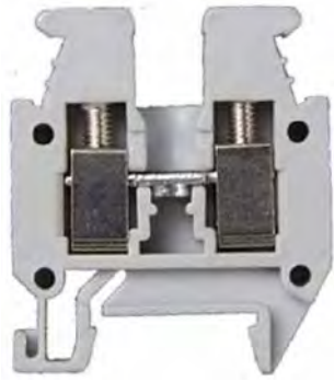
Terminal Width 4.2mm ASIMT1.5

For mounting on the 15mm DIN rail, these very small terminal blocks are ideal for applications where space in the enclosure is limited in all directions. They are available in single level, multiple wire and dual level designs.