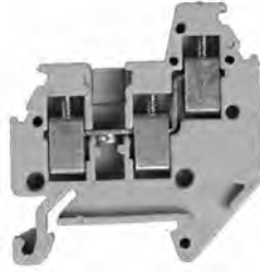
Terminal Width 4.2mm ASIMT1.5TWIN