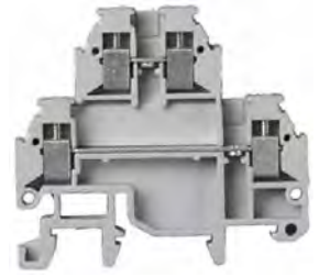
Terminal Width 4.2mm ASIMTTB1.5