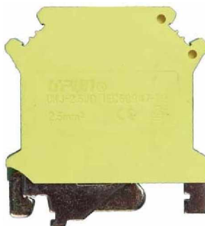
Terminal Width 5.2mm ASIUSLKG2.5N