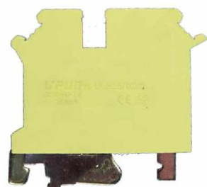
Terminal Width 5.2 mm ASIUK3TWINPE