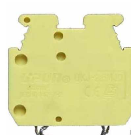
Terminal Width 5.2 mm ASIMBK3EZPE