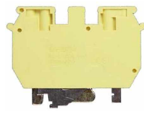
Terminal Width 6.2mm ASIUDK4PE