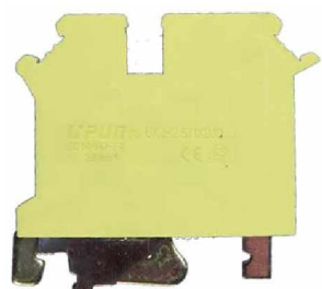
Terminal Width 6.2mm ASIUK5TWINPE