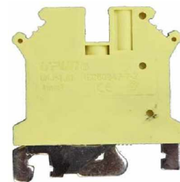
Terminal Width 6.2mm ASIUSLKG5