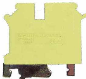
Terminal Width 6.2mm