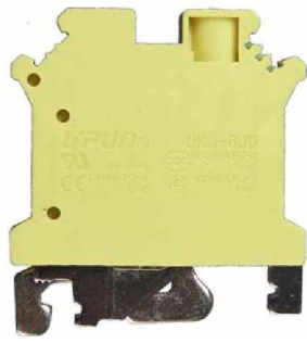
Terminal Width 8.2mm

The ground circuit terminal blocks are molded in the internationally accepted colors of green and yellow. When attached to the DIN rail, terminated wires are connected directly to the DIN rail.