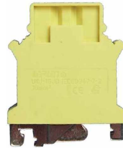
Terminal Width 12.2mm