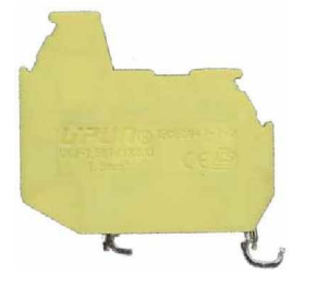
Terminal Width 4.2mm