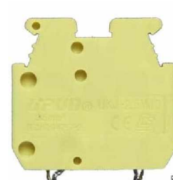
Terminal Width 4.2mm