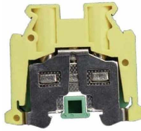
Terminal Width 8.2mm