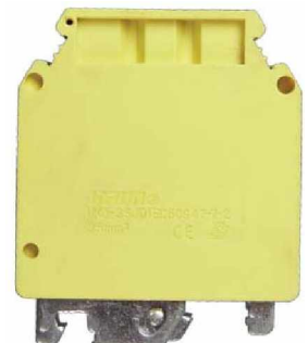
Terminal Width 15.2mm