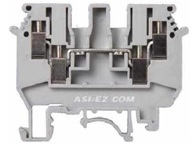
Terminal Width 5.2mm