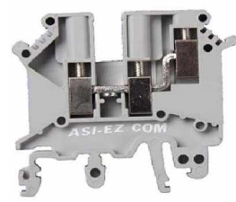
Terminal Width 6.2mm