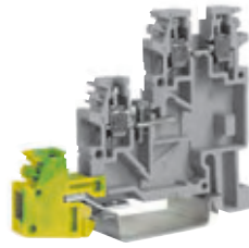
with earth connection on lower level